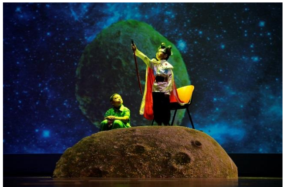
TALENTED ACTOR: Students of PPIS (Bedok) performing the story of The Little Prince.

Title: 200 Children Showcased Their Talents in a Showcase Organised By a Charitable Organisation Media/Date: Berita Harian, 21 September 2016 Translated by: Zulaygha Zulkifli